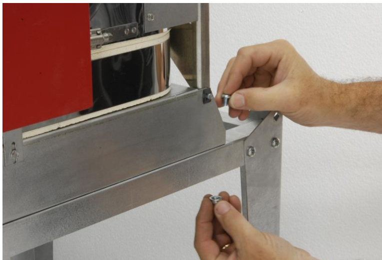
Insert a bolt through each side of rear base and stand frame angle and secure with nut.