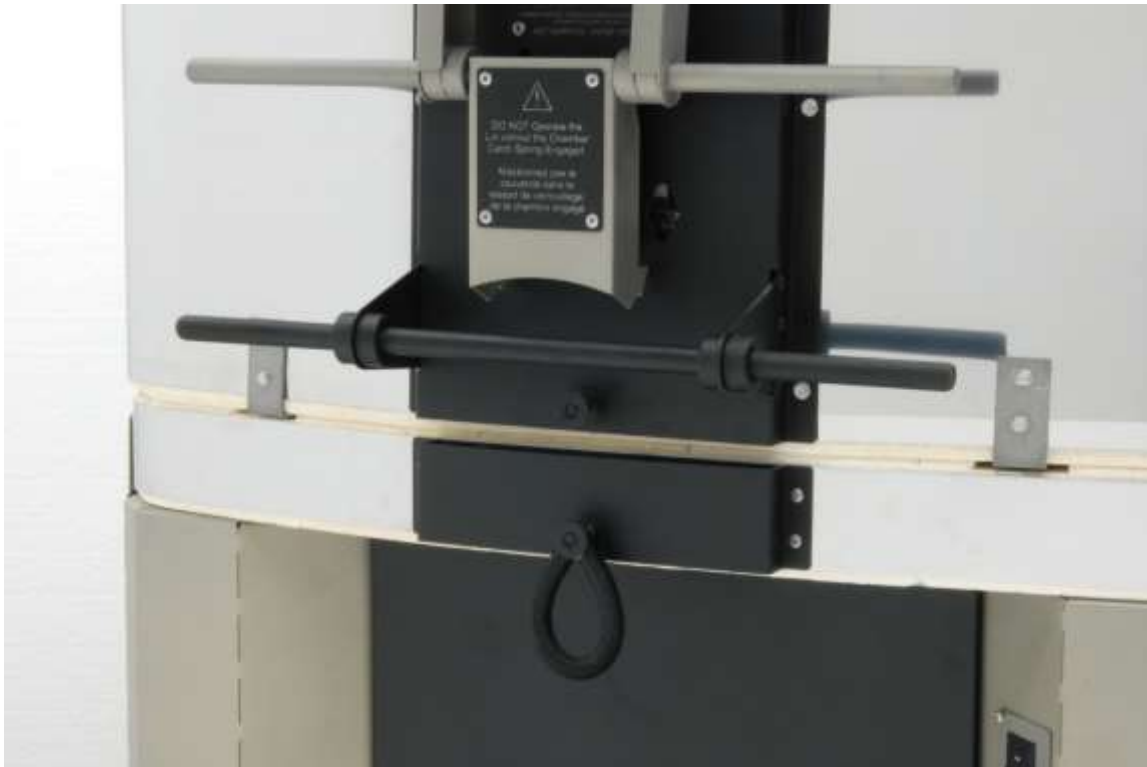
Figure 2 - Chamber Safety Catch Unsecured

To operate the chamber: verify that the lid is closed, and the Chamber Safety Catch spring is not secured to the chamber as shown (Fig. 2). Grasp the chamber handle with both hands and raise the chamber back until it automatically stops. As it stops, the Chamber Safety Bar notch will drop into the wire form catch located on the base. The chamber will now stay in the fully open position. To lower the chamber, grasp the chamber handle with your right hand and the chamber safety bar with your left hand. Pull the chamber safety bar towards you. Begin to lower the lid until the notch in the chamber safety bar clears the wire form catch. Once it does, remove your left hand from the chamber safety bar and grasp the chamber handle with both hands. You are now able to gently lower the chamber to the closed position.