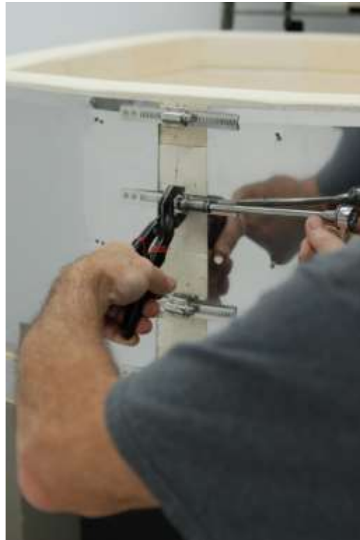
Figure 6 – Tightening with 5/16” Socket