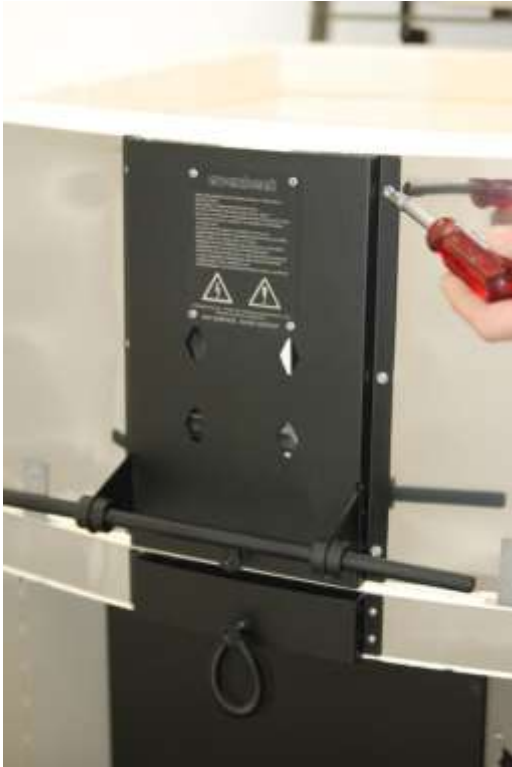
Figure 3 - Remove Chamber Handle Assembly