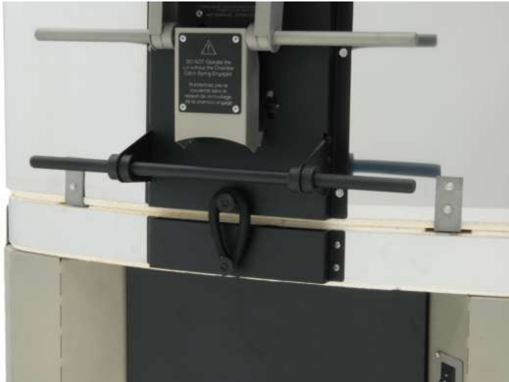
Figure 1 - Chamber Safety Catch Engaged

Note that before you operate the lid, the chamber must always be closed, and the chamber safety catch spring must be secured to the chamber (as shown above). This prevents accidental movement of the chamber while operating the lid.