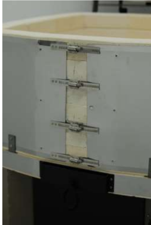
Figure 4 - Expose Jacket Clamps