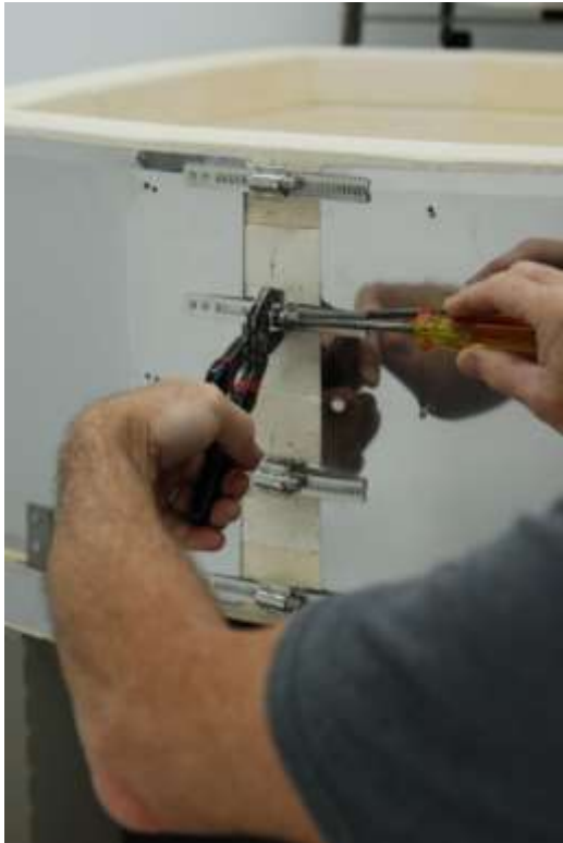
Figure 5 - Tighten All Clamps